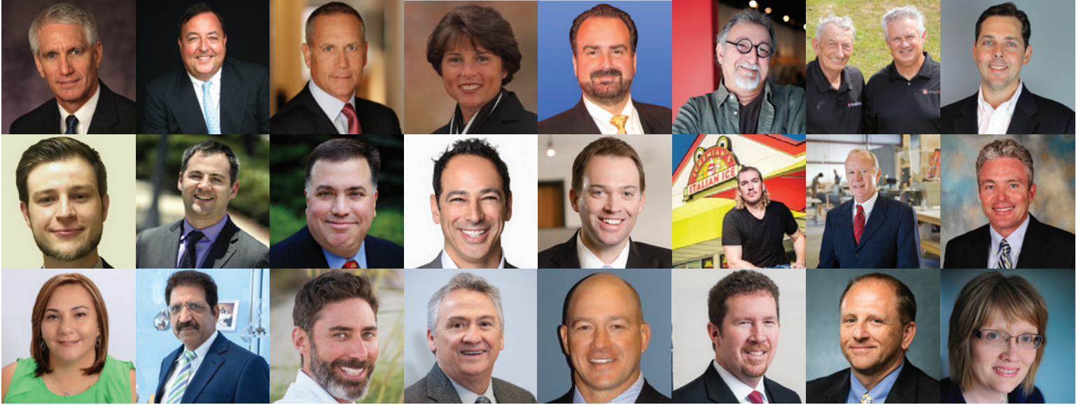
Florida Companies to Watch Honorees

TAKING SUCCESSFUL COMPANIES TO THE NEXT LEVEL